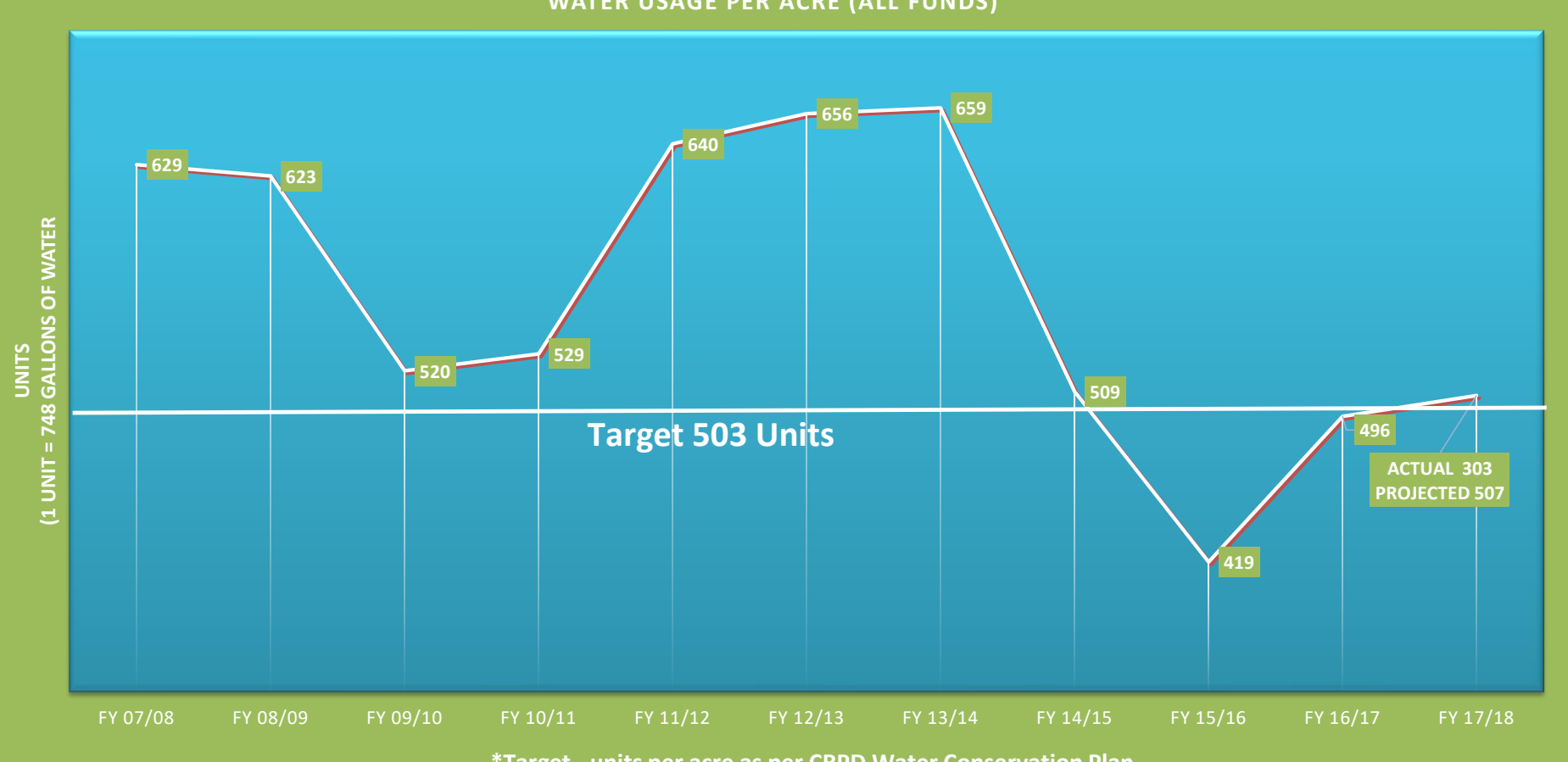
*Target - units per acre as per CRPD Water Conservation Plan